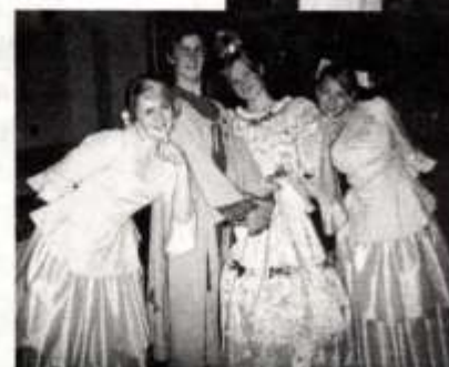
Stories represented counterclockwise from upper left: The Shepherdess and the Chimneysweep; The Steadfast Tin Soldier; Father's Always Right; The Princess and the Pea; The Emperor's New Clothes; The Little Match Girl; The Swineherd; Little Ole; The Tinderbox; The Nightingale; Simple Simon (a.k.a. Hans Clodhopper)