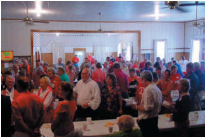
Everybody singing "Kong Christian" and preparing to toast the Queen.